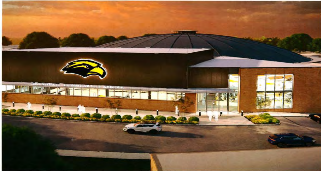
Rendering 2: Front Entrance of Reed Green Coliseum Facing 4 th Street